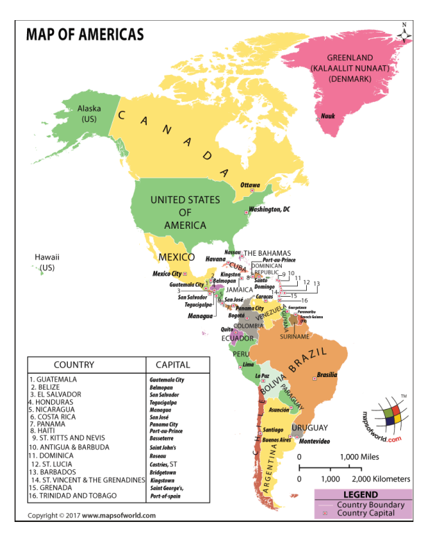
Maps of the World <a href="https://www.mapsofworld.com/americas/">https://www.mapsofworld.com/americas/</a>

Your contributed question for the Midterm Exam is due on Wednesday.