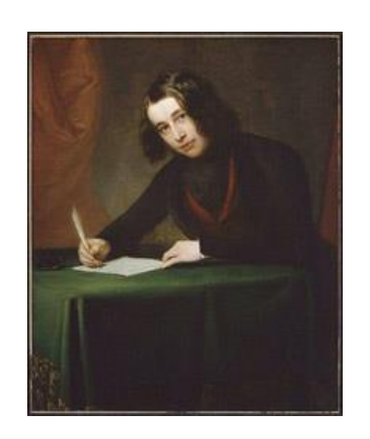
Charles Dickens (1842)